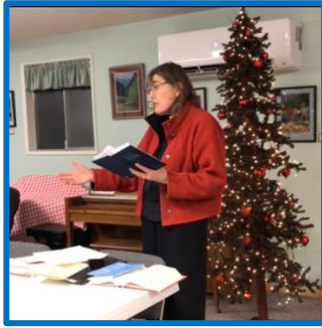
Midweek soup suppers with Bible study and worship