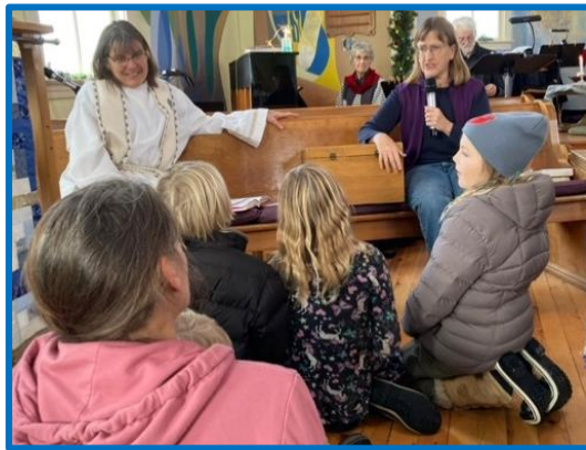
Children’s sermons and Lefse making.....