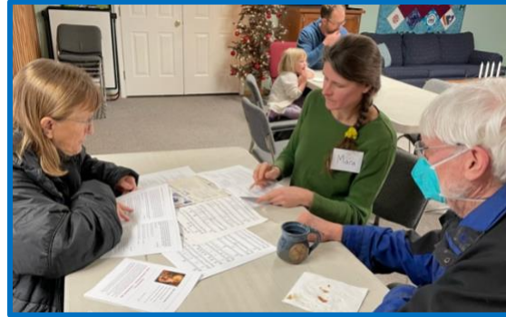
The “punting” musician team putting heads together for Christmas worship