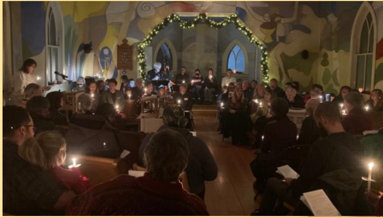
Christmas Eve at Faith