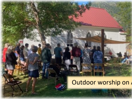
Outdoor worship on August 18

Outdoor worship is scheduled on the second and third Sundays of the month if weather permits.