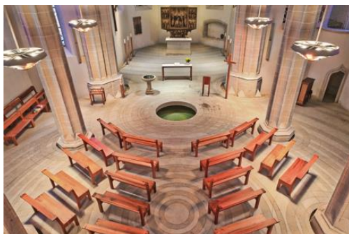
St. Petri-Pauli Church, where Martin Luther was baptized on 11 November 1483 in Eisleben.

Since 2012, the reformer's baptismal church has focused on the theme of baptism through its modern design, making it more than just an authentic Luther site. Originally built , the three-nave church building underwent several transformations over the centuries. The modern circular baptismal fountain is a central design element and the baptismal font contains remnants of Luther's baptismal font at the time.