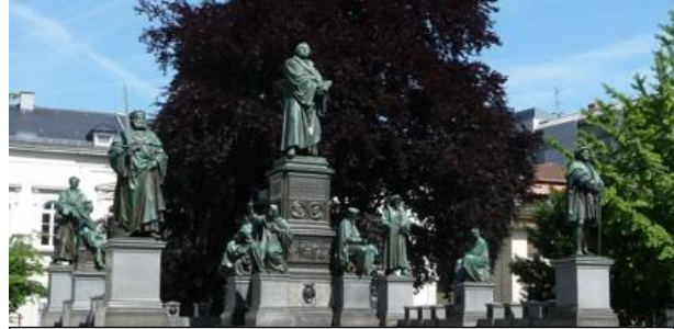
Luther statue in Worms, Germany. He stands alone surrounded by his accusers of heresy at the Diet of Worms defending his conscience and beliefs at the risk of death.

1546: Luther dies of heart failure in Eisleben, Germany, the village of his birth and baptism after completing a three-week protracted successful mediation resolution settlement concerning an inheritance dispute between mine owners and the Mansfield Mining Company that was causing civil disorder. (Age 63)