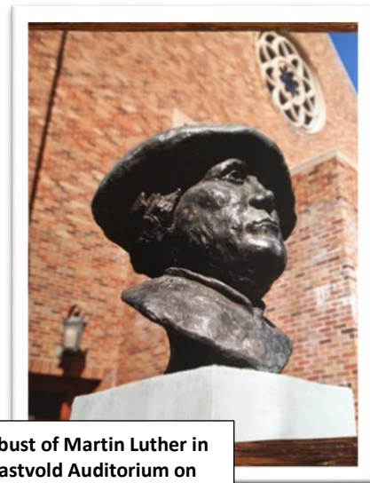
This is the bust of Martin Luther in front of Eastvold Auditorium on the campus of Pacific Lutheran University in Tacoma, WA.

Martin was ordained a Catholic priest in 1507. By 1517 he challenged the papacy in Rome regarding the sale of indulgences in exchange for eternal salvation among other issues. He was excommunicated from his church; eventually labeled a "heretic" throughout Germany. Standing before the Emperor of the Holy Roman Empire and his cabinet he refused to recant and stood alone resolved to his own conscience. Today how can we impact our world, influence our natural environment, improve interpersonal relationships? One person at a time.